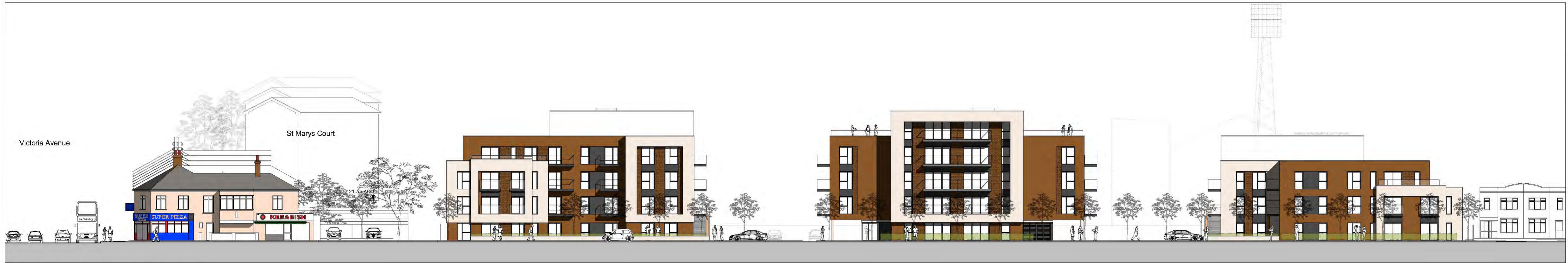
Fairfax Drive - Street Elevation in Context